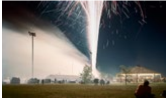
Manal Abu-Shaheen 4th of July . Tupper Lake, NY, printed 2019 Archival fiber inkjet print Edition 1 of 5 + 2 AP's, 27.5" h x 34" w