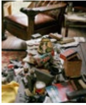
Manal Abu-Shaheen Antiques . Julian, PA, 2019 Archival fiber inkjet print in artist frame Edition 1 of 5 + 2 AP's, 21" h x 16" w

September 20 – November 8, 2019, curated by Laura August