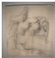
Oscar Rene Cornejo Citizen , 2019 Pigment on plaster and coal on wooden panel 5" x 7"