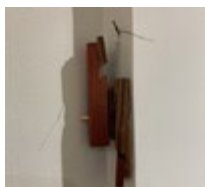
Oscar Rene Cornejo Compass , 2019 Cherry, Bocote, and Purple Heart 7" x 2" x .25"