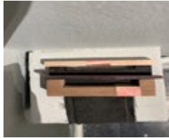
Oscar Rene Cornejo Double consciousness , 2019 Walnut, Purple Heart, maple, ebony, woodblock on handmade paper, natural dye cotton, 2" x 5" x 1.25"