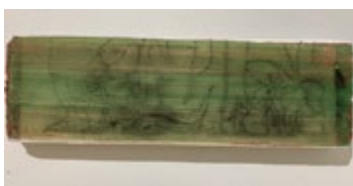
Oscar Rene Cornejo Caminantes , 2019 Pigment on Plaster and coal on wooden panel 7" x 15"