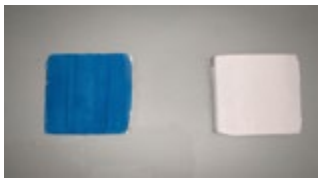
Oscar Rene Cornejo The sky was the limit (Diptych) , 2019 Pigment on plaster on wooden panel 16" x 7"