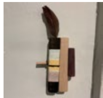
Oscar Rene Cornejo Found in flight , 2019 Poplar, Purple Heart, woodblock print on handmade paper, parrot feather with flower, 5" x 3" x 1"