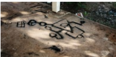
Manal Abu-Shaheen Thomas's Porch Drawing . Julian, PA, 2010 Archival fiber inkjet print mounted on sintra Edition 1 of 5 + 2 AP's, 12" h x 18" w