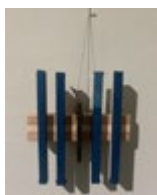
Oscar Rene Cornejo Inner horizon , 2019, Maple, ebony, cypress, lightning struck wood. Woodblock print on handmade paper. Indigo dyed handmade paper, 5" x 5" x 2"