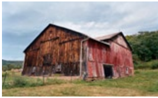
Manal Abu-Shaheen Barn . Julian, PA, printed 2019 Archival fiber inkjet print Edition 1 of 5 + 2 AP's, 20" h x 25" w