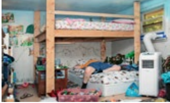
Manal Abu-Shaheen Untitled (loft bed) . Julian, PA, 2014 Archival fiber inkjet print in artist frame Edition 1 of 5 + 2 AP's, 22" h x 33" w