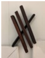
Oscar Rene Cornejo Borders , 2019 Cypress and ebony 6.5" x 6" x 1.5"