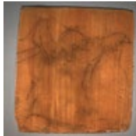
Oscar Rene Cornejo When the future was now , 2019 Pigment on plaster and coal on wooden panel 5" x 7"