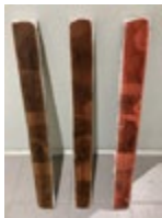
Oscar Rene Cornejo Trac, Trac, Trac (triptych) , 2019 Pigment on plaster and coal wooden panel 21" x 33"