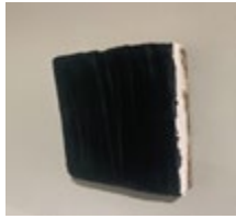
Oscar Rene Cornejo New Moon , 2019 Pigment of plaster on wood 5" x 7"