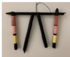
Oscar Rene Cornejo Home, Ash wood , 2019 Woodblock on handmade paper 6.5" x 6" x .5"