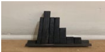
Oscar Rene Cornejo Community , 2019 Ebony, Purple Heart, cypress, black limba, maple, Bocote, cherry, 6.5" x 4" x 1"