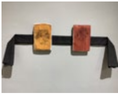
Oscar Rene Cornejo Barelife (Diptych) , 2019 Pigment on plaster and coal on wooden panel, natural dye cotton, 22" x 7"