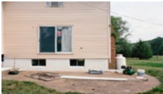
Manal Abu-Shaheen Untitled (Fay and side of the house) . Julian, PA, 2019 Archival fiber inkjet print Edition 1 of 5 + 2 AP's, 24" h x 30" w