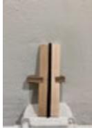
Oscar Rene Cornejo Gravity , 2019 Cypress, Maple, Ebony, Bocote 5" x 2" x 1"