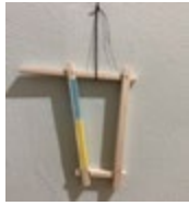
Oscar Rene Cornejo Torso , 2019 Maple woodblock on handmade paper 5" x 5.5" x .25"