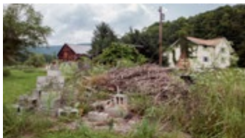
Manal Abu-Shaheen Untitled (piles) . Julian, PA, printed 2019 Archival fiber inkjet print mounted on sintra Edition 1 of 5 + 2 AP's, 16" h x 24" w