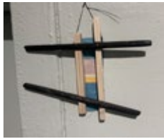
Oscar Rene Cornejo Horizons , 2019 Ash wood, Maple, woodblock print on handmade paper, 6.5" x 5.75" x 1"