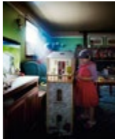
Manal Abu-Shaheen Doll House . Julian, PA, 2010 Archival fiber inkjet print in artist frame Edition 1 of 5 + 2 AP's, 18.5" h x 14" w