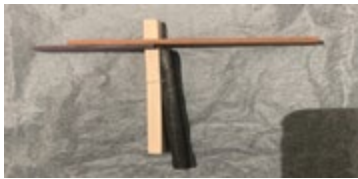
Oscar Rene Cornejo El Salvador , 2019 Ash wood, Maple, cherry, Purple heart 7" x 6" x .75"