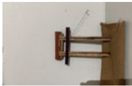
Oscar Rene Cornejo Inner temple , 2019 Cherry, bocote, Purple Heart, natural dye cotton 5" x 4.75" x 1"