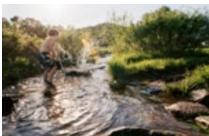
Manal Abu-Shaheen Creek . Julian, PA, printed 2019 Archival fiber inkjet print mounted on sintra Edition 1 of 5 + 2 AP's, 18" h x 22" w