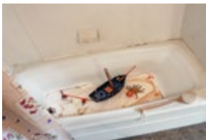
Manal Abu-Shaheen Bathtub . Julian, PA, printed 2019 Archival fiber inkjet print mounted on sintra Edition 1 of 5 + 2 AP's, 18" h x 22" w