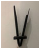
Oscar Rene Cornejo Poem of the heart , 2019 Ash wood, Purple Heart 7" x 3" x 1.5"