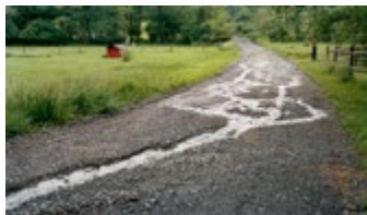
Manal Abu-Shaheen Untitled (road after rain) . Julian, PA, 2019 Archival fiber inkjet print Edition 1 of 5 + 2 AP's, 24" h x 30" w