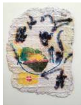
Loren Britton Tablet with Sunrise (Hey, Dawn!), 2017 13" wide x 17" high Paper Pulp