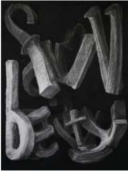
JF Lynch Beautiful (full of beauty), 2017 Charcoal on canvas 36" x 48"