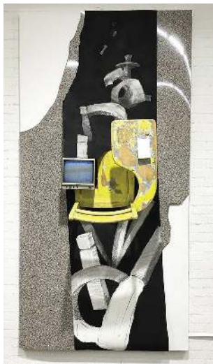
JF Lynch Untitled (divination), 2016 Charcoal on cut paper, desk chair, CCTV monitor, DVD Player, formica and notebook on panel 48" x 96"