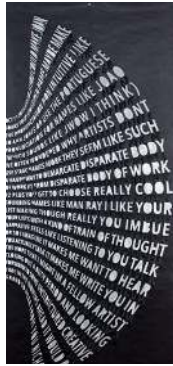
Nicholas Fraser OCT 11 2015 JJ, 2017 Hand-cut black tyvek 42" x 92"