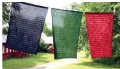
Nicholas Fraser Left Hanging, Video documentation of Art Omi Installation, 3 twin bedsheets with bleached texts, 2016 96" x 66" each