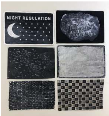
Maria Dimanshtein Looking for Patterns, 2016 Mixed media – black paper, white ink, glitter, acrylic paint, fabric, laser printouts. Consists of 6 individual pieces, each 12" x 18"