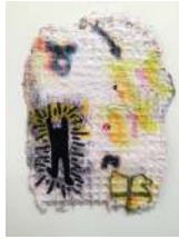
Loren Britton Come to the Water, 2017 13" wide x 17.5" high Paper Pulp