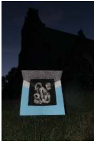
JF Lynch Untitled (free guy), 2018 Digital print (ed of 3 w/ 1 AP) 24" x 36"