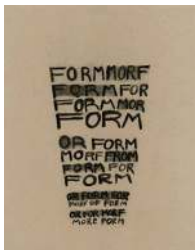
JF Lynch The Art Lecture (form morf from form), 2018 Charcoal on paper (Ed of 3 w 2 APs) 18" x 28"