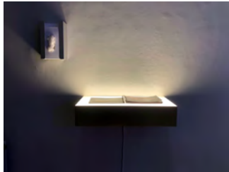
Aron Louis Cohen Unmaking Time, Forward and Reverse , 2012 / 2017, Duraclear prints, plexiglas, wire binding stainless steel 5" x 24" x 12"