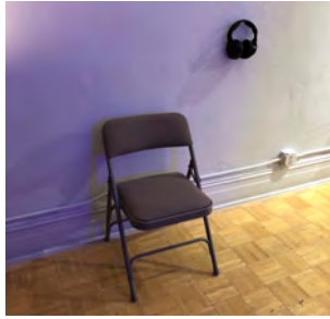
Aron Louis Cohen Guided Meditation for the End of the World , 2017, Digital audio, 15 min,