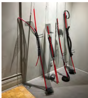
Erica Stoller Sentinels, 2017 Various materials including plastic and metal Variable configurations, as set up in the exhibition: 74" high x 66" wide x 12" deep,