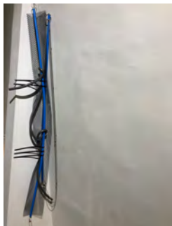
Erica Stoller River Run, 2017, Plastic and metal, 80" high x 26" wide (variable dimensions),