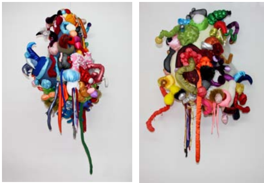
Maria Lynch Scape 1 70cm x 120cm syntectic foam and Fabric 2014 $8.000 Scape2 80cm x130cm syntectic foam and Fabric 2014 $8.000